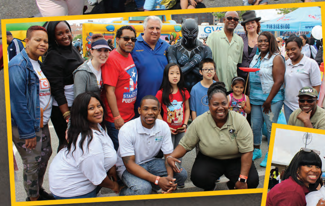
Members and families turned out in big numbers to the Local 100 Family Day events in Westchester (above) and Coney Island (photos left and below).