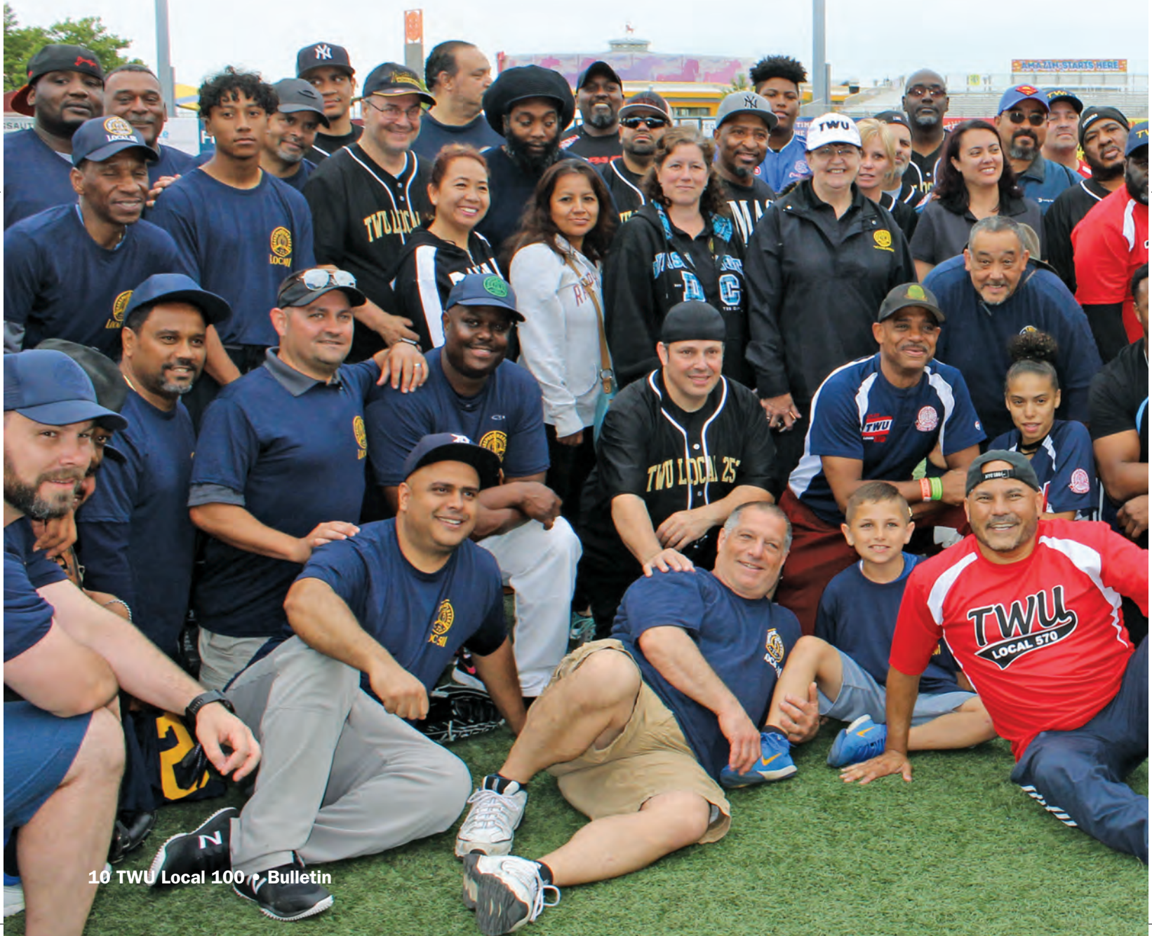
10 TWU Local 100 • Bulletin

DESPITE A THREAT OF HEAVY RAIN AND THUNDERSTORMS, THOUSANDS OF TWU LOCAL 100 members and their families turned out for the union's annual Family Day celebration on Saturday, June 23, 2018.