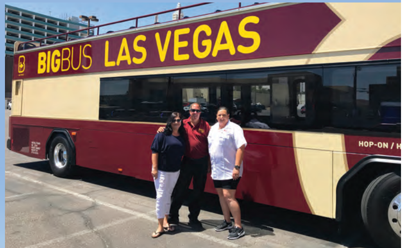
Here's three of the newest TWU Local 100 members at Big Bus/Las Vegas.