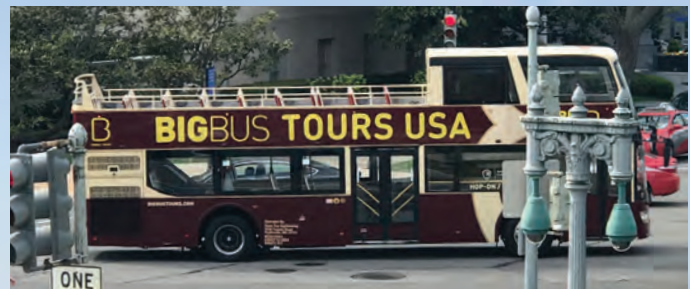
The union represents Big Bus workers in Washington, DC as well.