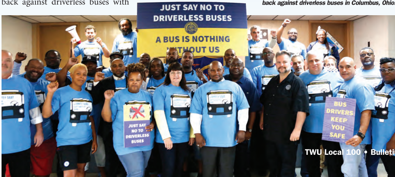
TWU Local 100 • Bulletin 25