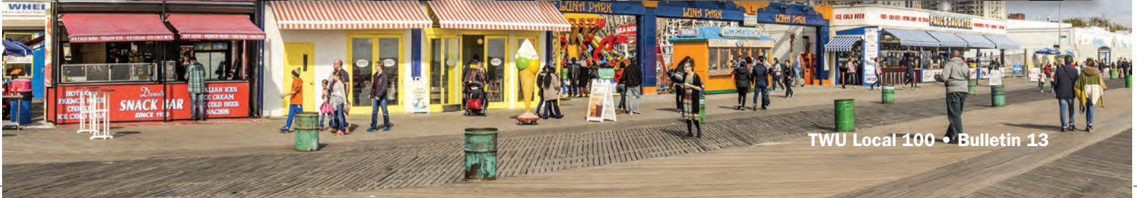
TWU Local 100 • Bulletin 13