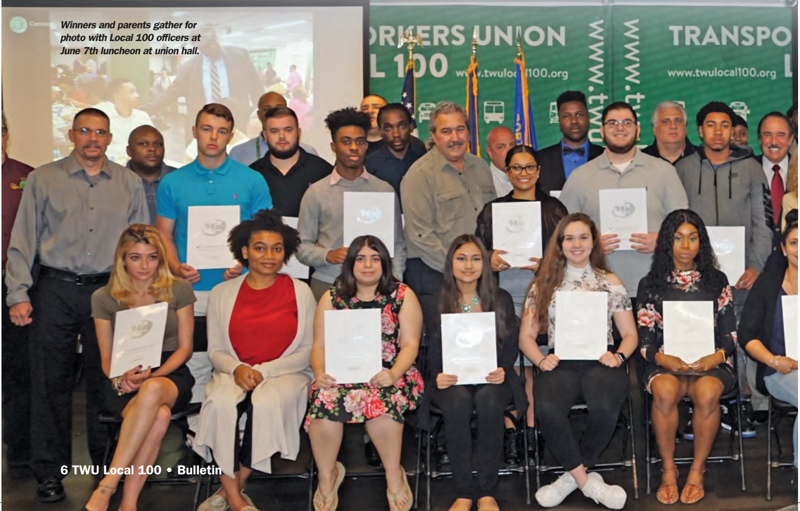
Winners and parents gather for photo with Local 100 officers at June 7th luncheon at union hall.

Four students won $5,000 scholarships, while the others won $1,000. Each scholarship is for the 2017 academic year, and every eligible student or member can apply each