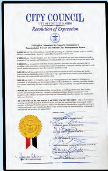
The City Council resolution supporting the union position.

Since the grant award, TWU has been pushing back against driverless buses with