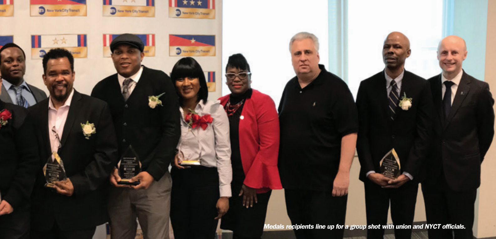
Medals recipients line up for a group shot with union and NYCT officials.