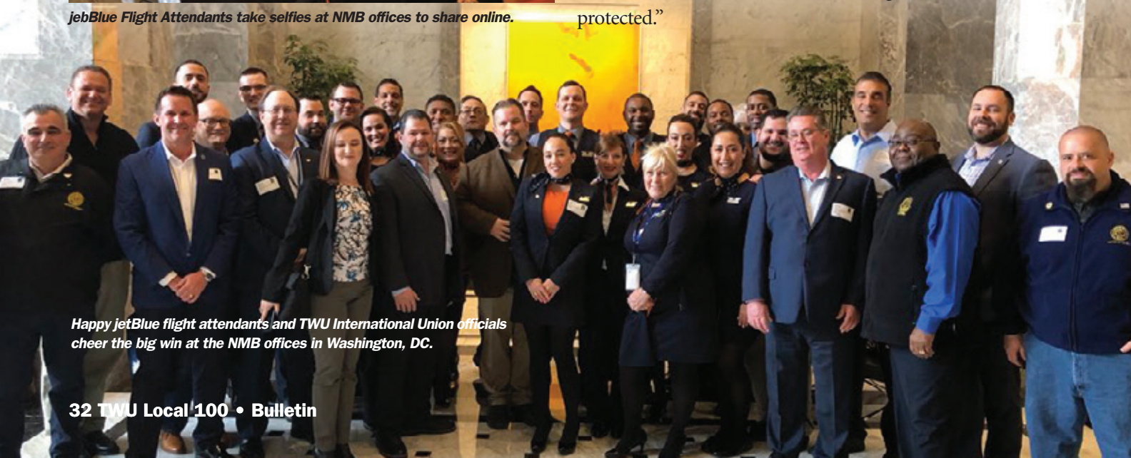
Happy jetBlue flight attendants and TWU International Union officials cheer the big win at the NMB offices in Washington, DC.