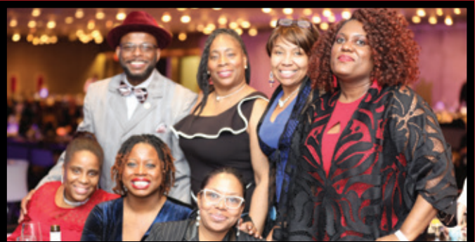
Local 100 officers and staff at dinner featuring Gov. Cuomo as keynote speaker.