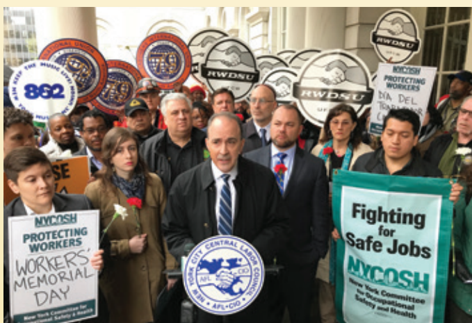
Families of transit workers killed on the job with union officers at Workers Memorial Day event at union hall.