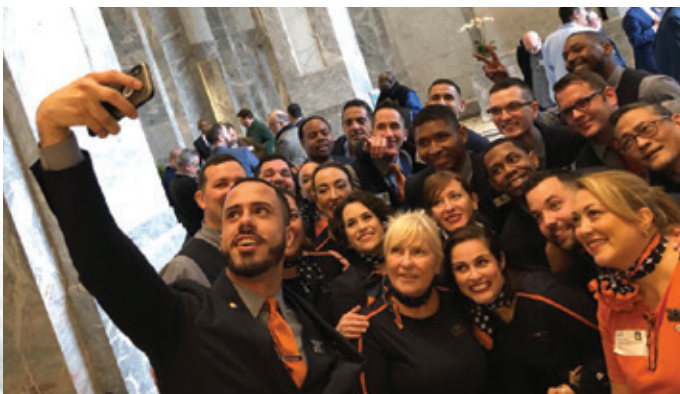
jetBlue Flight Attendants take selfies at NMB offices to share online.

He added that if the company refuses to bargain in good faith, they better be ready for severe pushback. “This union is prepared to engage in a fightback campaign that will continue until a contract is secured and the Inflight Crewmembers are protected.”